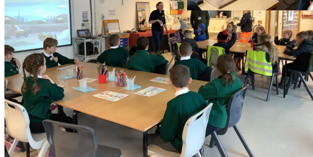
Discoverers Quarry Trip