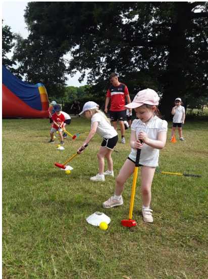
Having fun with activities when Active