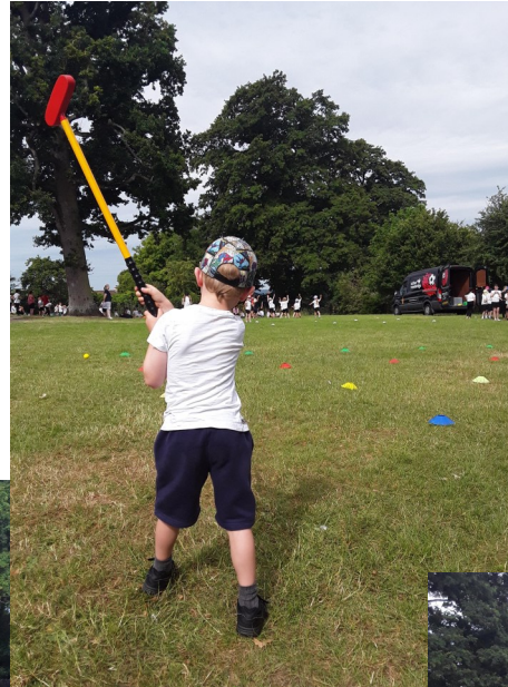
new games and Trowbridge came.